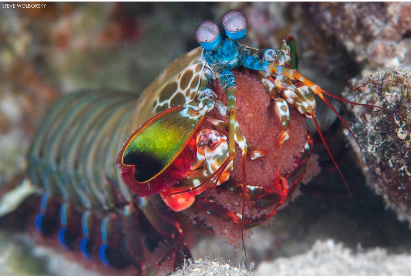
Peacock mantis shrimp, Odontodactylus scyllarus , with brood of eggs