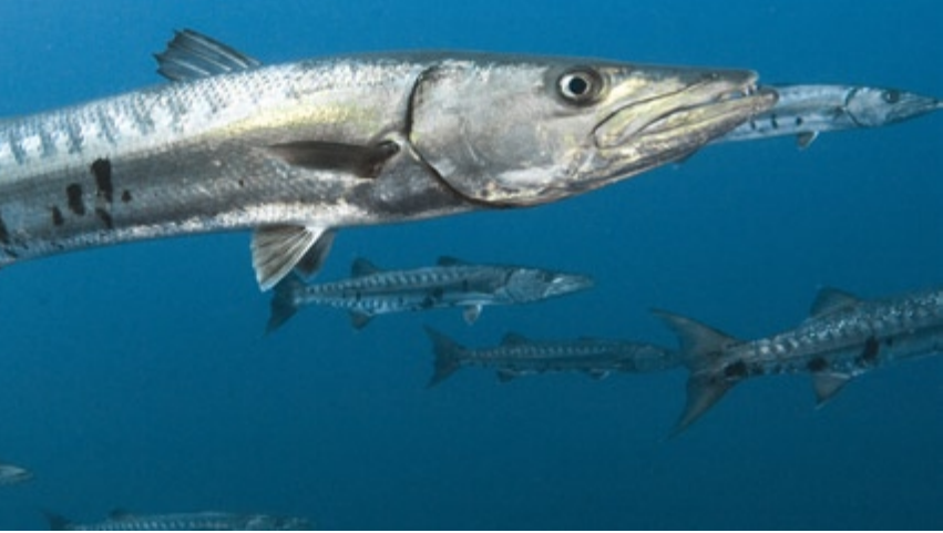
CLOCKWISE FROM LEFT: Sandtiger shark with diver; Barracudas above the wreck of the Spar, Lionfish; School of Atlantic spade fish. PREVIOUS PAGE:

ums. However they got there, they appear to be flourishing. As they have no natural enemies, it looks as though the ecosystems that they have invaded may be chanaed forever by their presence.