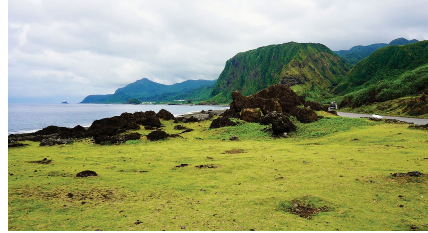
Pinnacle top at Lady Rock (left); Lush green Orchid Island topside scenery (above); Simon Pridmore and wife Sofie en route to the Badai Bay Wreck (right); Terrace of sea fans on Warship (previous page)