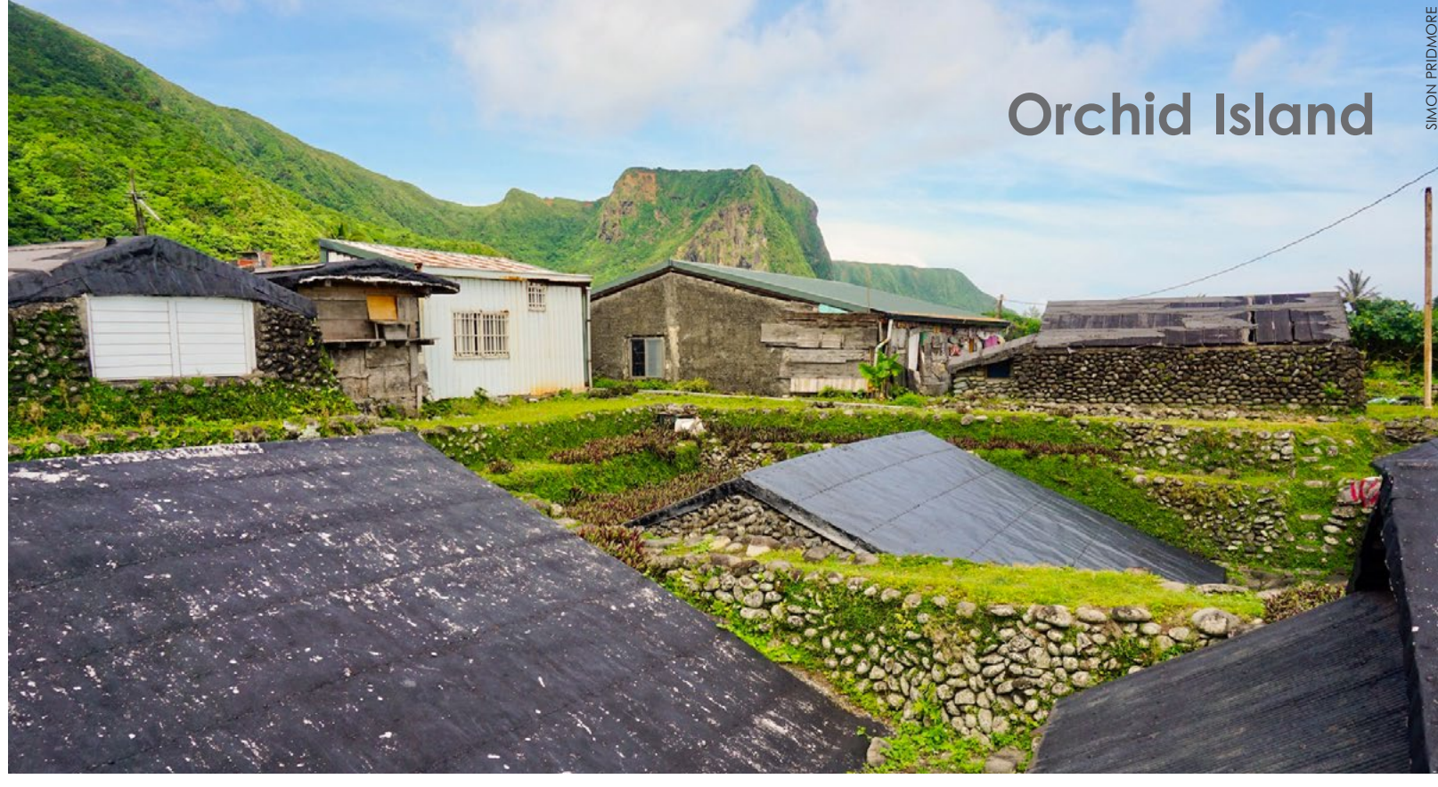
Ruaged, wild and beautiful Orchid Island (left); Traditional Tao village with "underground" houses (above); Traditional Tao flying fish canoes (right)