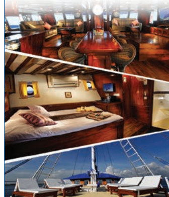
Contact us for further information