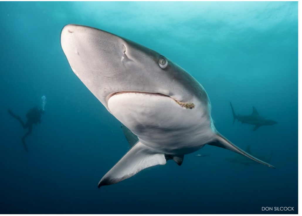
Oceanic blacktip sharks with divers (above and right); Oceanic blacktip shark with remoras (top left)

Known as grey nurse sharks in Australia and sand tiger sharks in the United States, the Carcharias