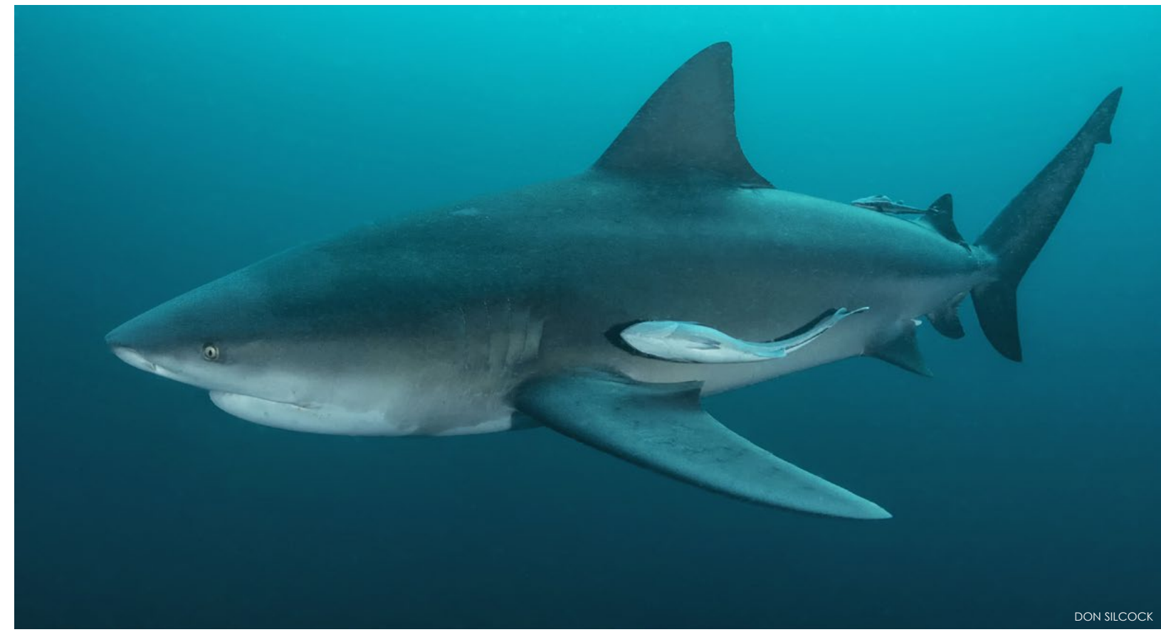
way they conduct their operation. CLOCKWISE FROM TOP LEFT: Underwater photographer with oceanic blacktip shark; Diversater at Main Cave entrance at Northern Pinnacle; Bull shark with remoras; Dive boat picking up divers after a dive

Asia correspondent Don Silcock is based in Bali, Indonesia. For extensive location guides, articles and images on some of the best diving locations in the Indo-Pacific region, visit his website at: Indopacificimages.com.