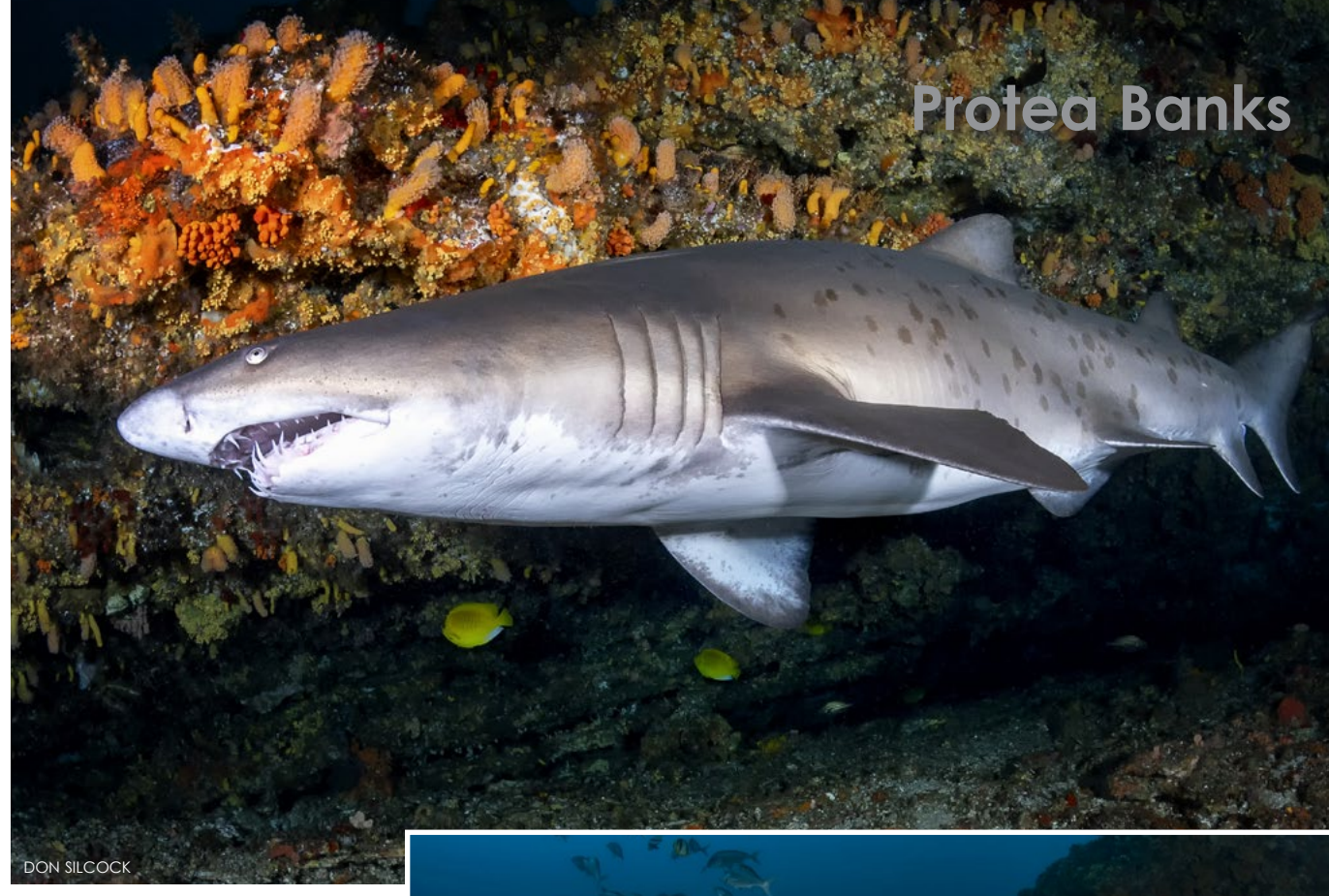
THIS PAGE: Ragged-tooth sharks, or "raggies" as they are called in South Africa, gather in the main cave at Northern Pinnacle; One has a hook with fishing line caught in its mouth (right)