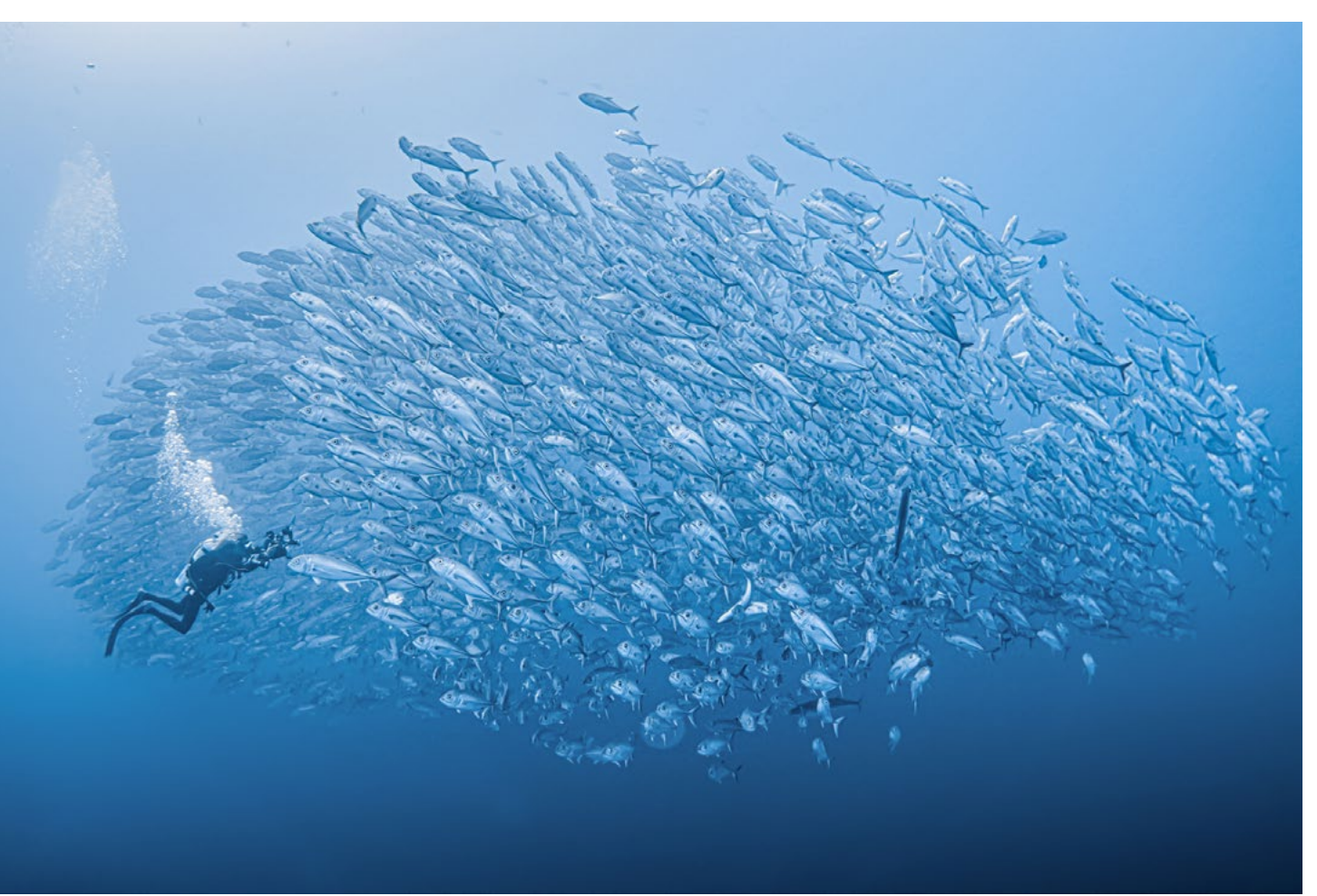
Diver with huge school of jack fish at Vaadhoo (above)

er as a group, letting the current push us swiftly along the reef. Visibility was good, and after a brief drift, we spotted a group of eight to ten mantas on our horizon, swimming over a small coral bommie rising between the reef and the sand.