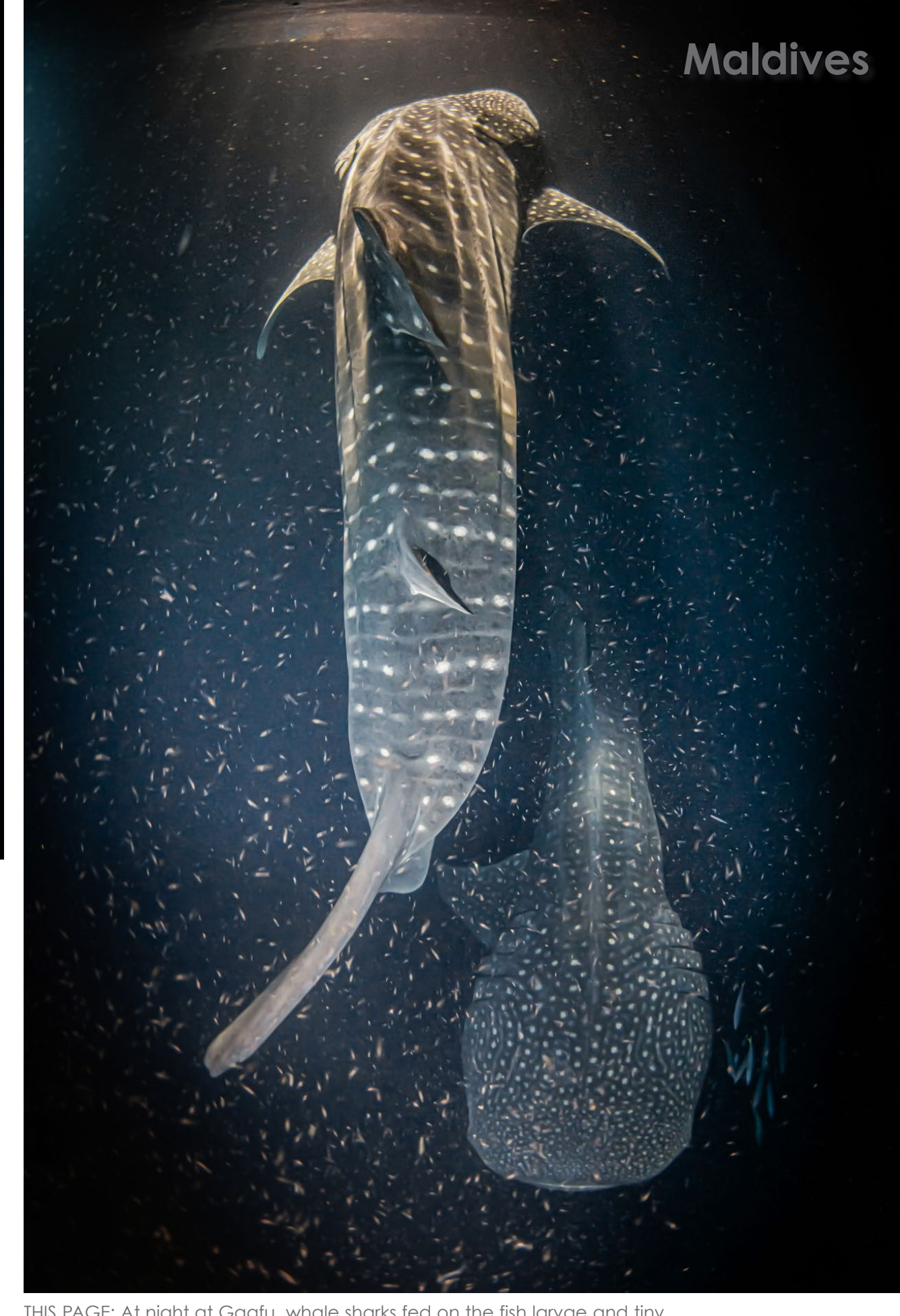
THIS PAGE: At night at Gaafu, whale sharks fed on the fish larvae and tiny crustaceans that accumulated under the spotlights of the dive boat's stern.

Maldives Blue Force One runs weekly routes all year round with guaranteed departures every Saturday. The Southern Hemisphere route lasts six weeks, from February to March, with an additional week at the beginning and another at the end to go down to the Southern Hemisphere or return to Malé. The one-week routes in the