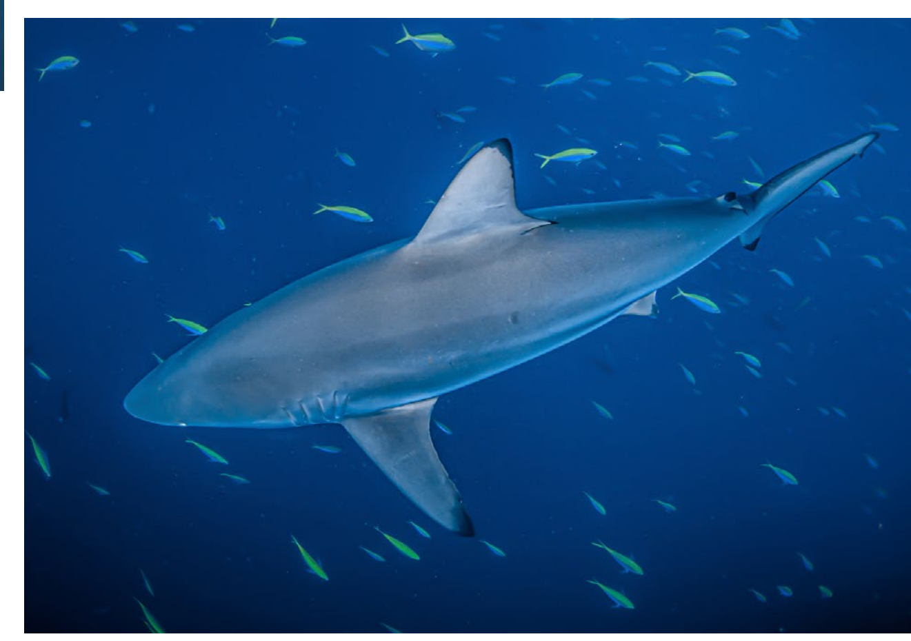
Gray reef shark at Gaafu (above); A turquoise lagoon in one of the deep south atolls (top right); Wall of silvertip sharks at Gaafu (top left); Tiger shark at Fuvahmulah Island (left)

In this atoll, at night, we enjoyed one of the most incredible moments of the cruise. Dive boat crews have learned from local fishermen that placing large