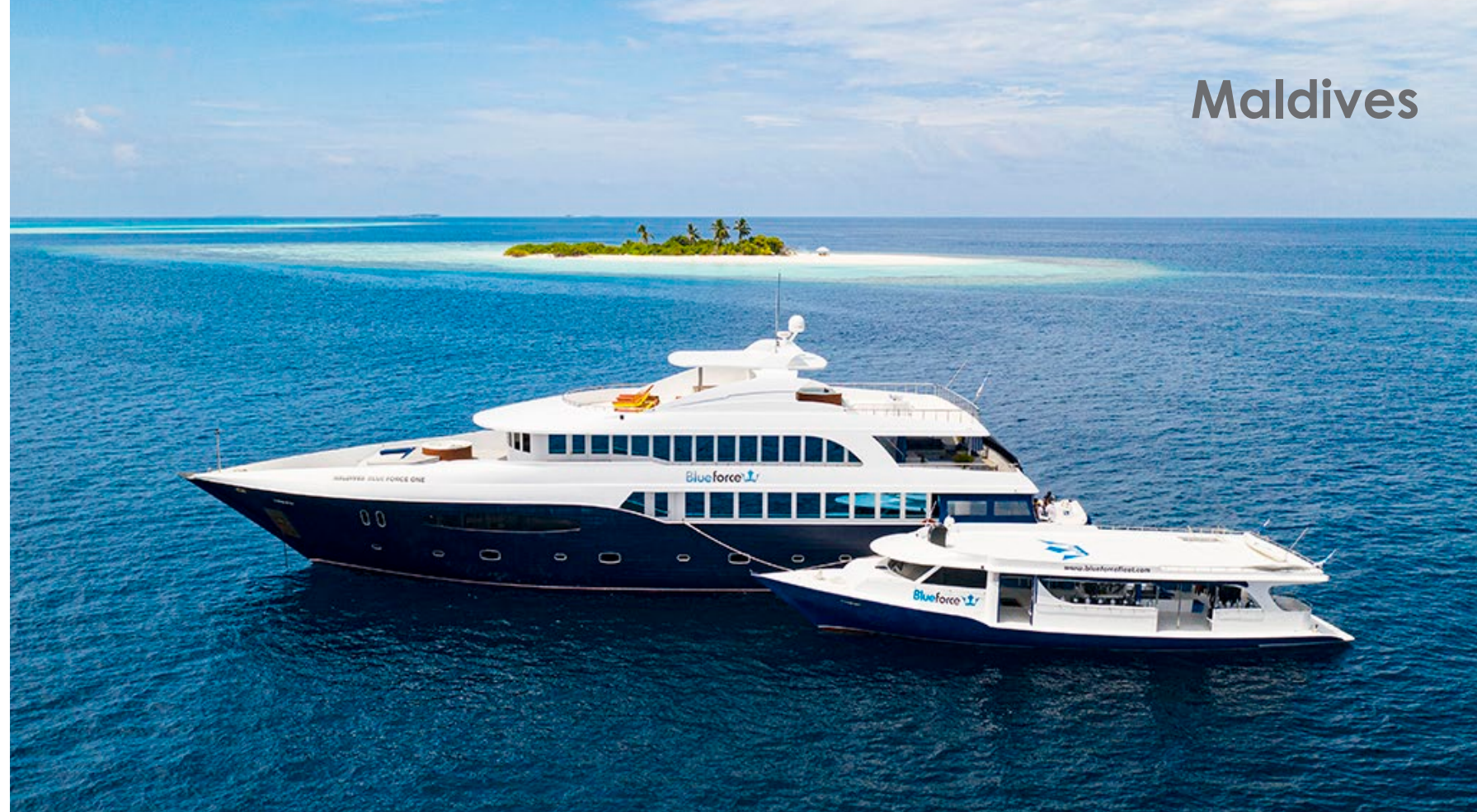
Maldives Blue Force One liveaboard, with dhoni attached, in the Maldives (above); Manta ray at Mudakan (top left)