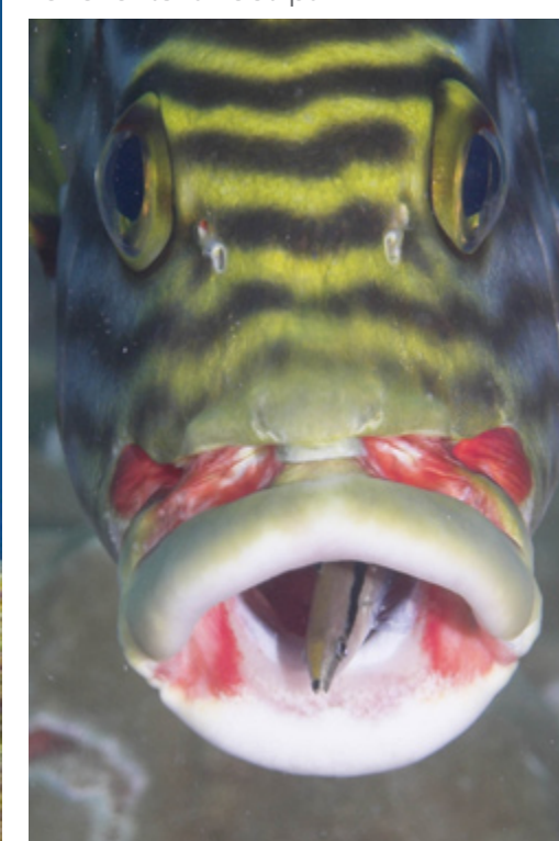
Cleaning station for oriental sweetlips