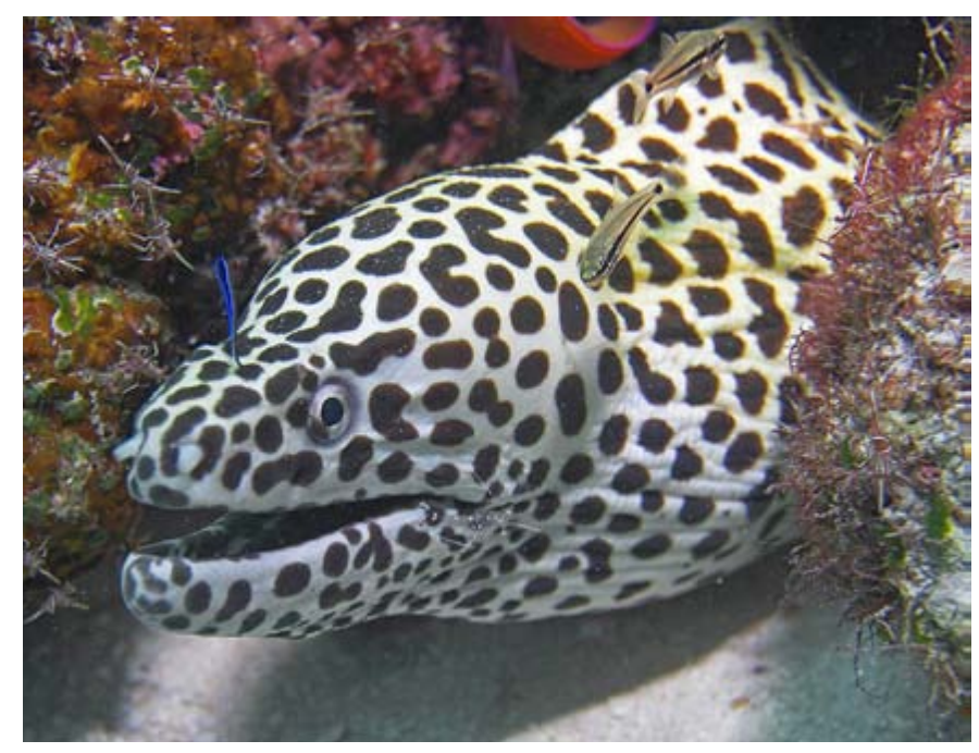
LEFT TO RIGHT: Giant clams of all sizes and colours were common; It wasn't all simple flat terrain; Glass fish; Honeycomb moray eel Gymnothorax favagineus with cleaner wrasse and shrimp

Site selection was made in the morning, dependant on the weather but mostly on the experience levels of those who