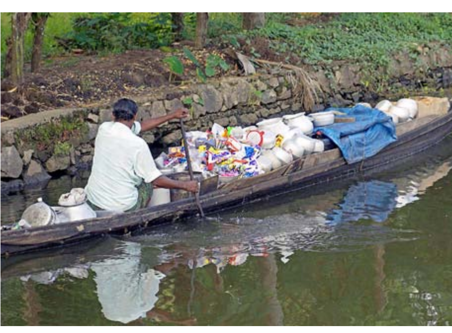
CLOCKWISE FROM ABOVE: Even the local shop arrives by canoe in the backwaters; Bangaram diving; The earthworms seemed to like the concrete homes at Spice Village; Water treatment at Coconut Lagoon