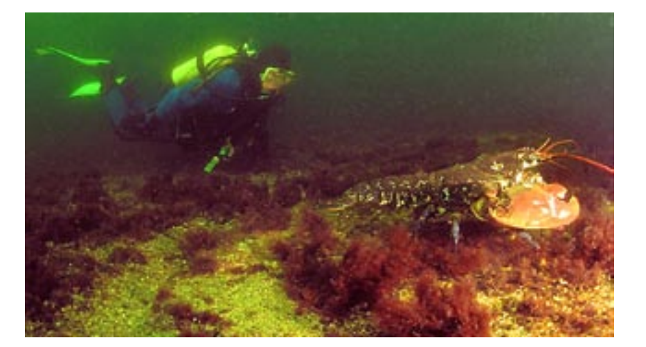
Lobster on the run.

Galway Chamber Galway Regional Hospital tel. 00 353 91-24222 ■