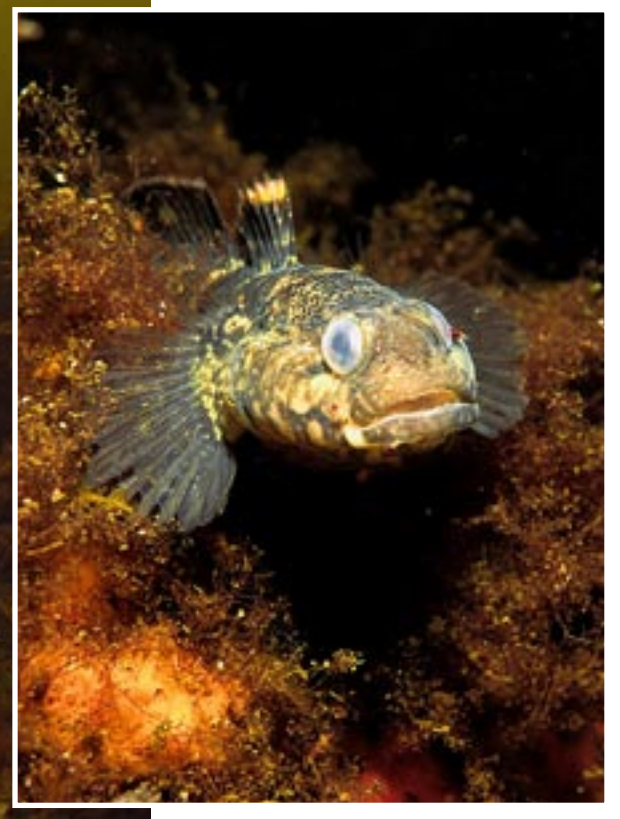
TOP INSET: Nudibranch BOTTOM INSET: Curious blennie

light bulbs. In places, various weeds and sponges appear to smother the colonies of serpulids, each species competing for space. It seems that the tubeworm colonies has been themselves colonised.