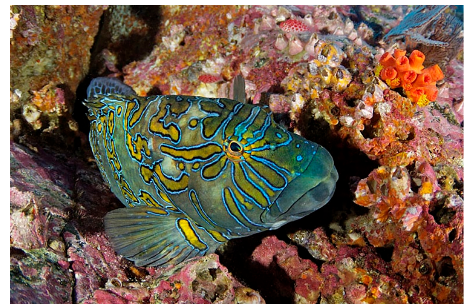
CLOCKWISE FROM TOP LEFT: Scorpionfish; Grouper getting cleaned by butterflyfish; Giant hawkfish; Sunset at the island of Malpelo

Just below the surface, we saw an arrow-shaped something shoot toward us, stop about three feet away, turn and disappear just as quickly. We saw just enough to realize that our brief visitor was a marlin. What a dive!