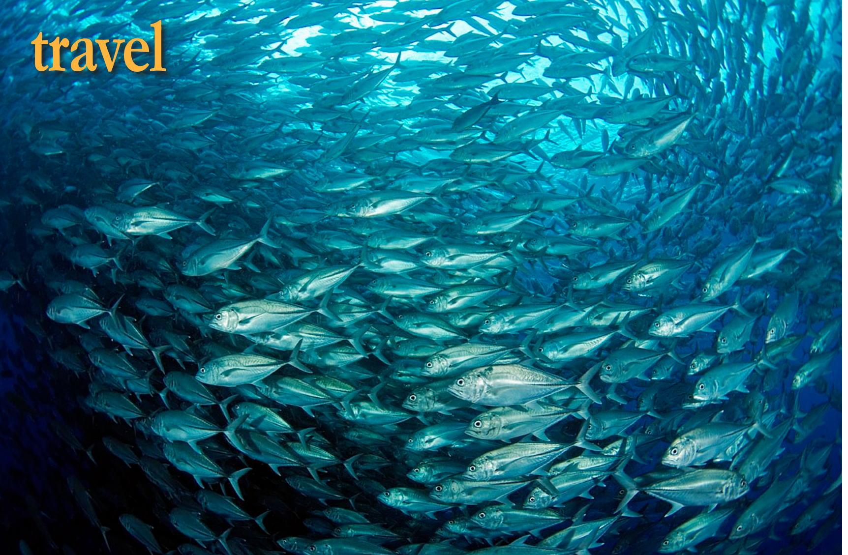
Giant school of jackfish (above); Tiny little corals blooming in the current (right)

swarm was gone. Visability cleared as the mackerel left us to move with the current.