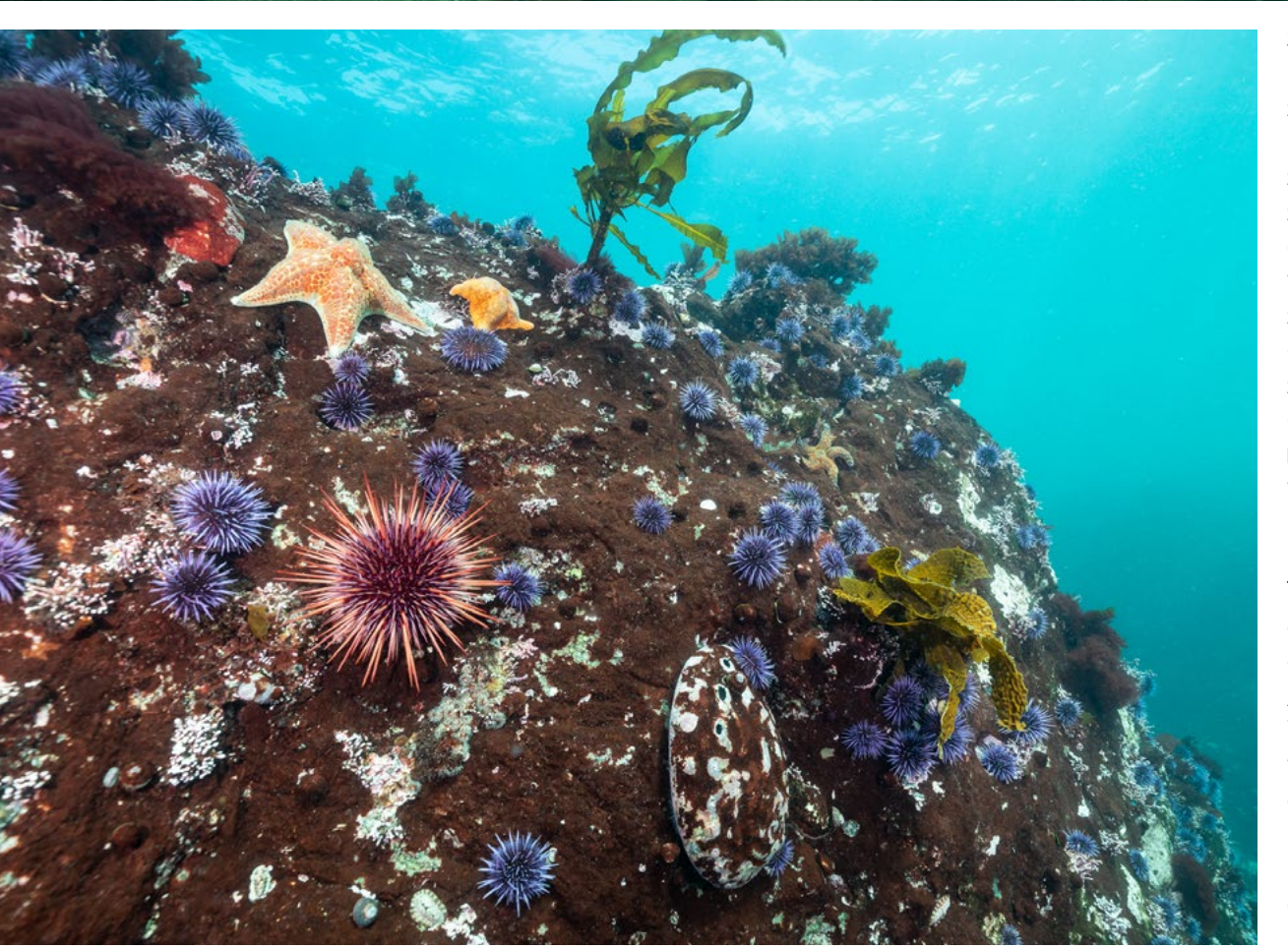
A classic Northern California shallow reef scene with sea urchins, starfish and kelp (above); Ambient light illuminates an area with a series of large rock slabs (top left).

Several curious fish species aggregate around the interesting divers (top right).