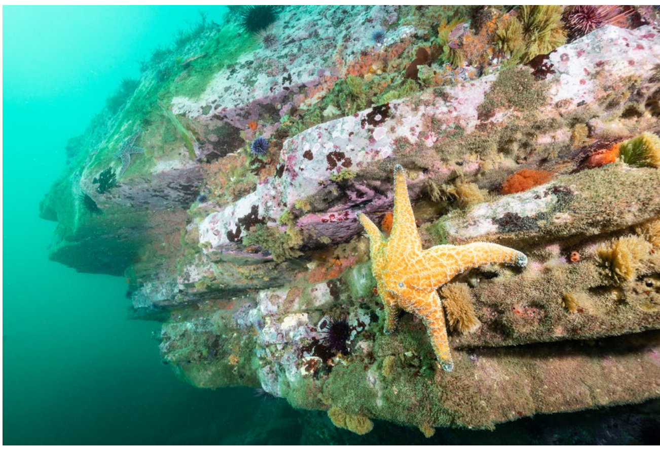
An ochre sea star (Pisaster ochraceus) clings to the rock reef.