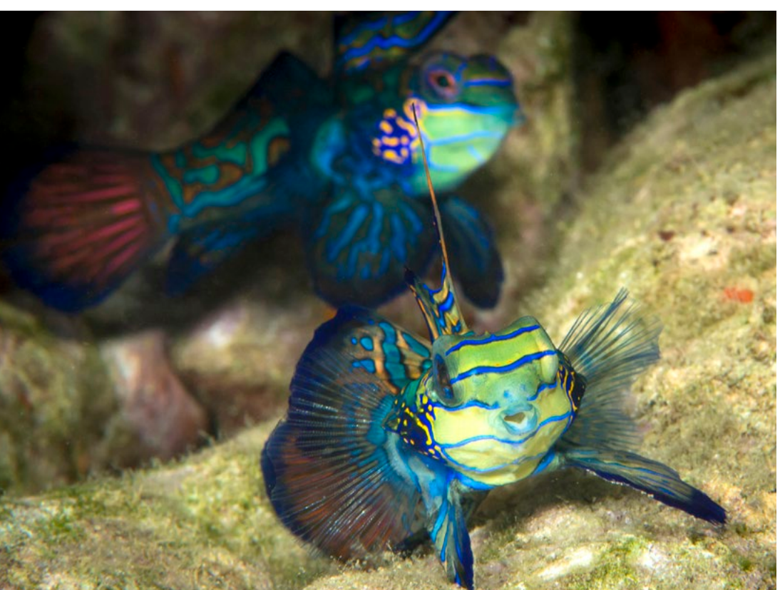
Two male mandarin fish showing off for a female

Another male also showed up and the two males had a bit of a face-off, with both competing for which one looked prettier. In turn, each male would puff up his body and stick his long, pointed dorsal fin straight up. While the males fought, the female fled back to her original coral head and then, lost in the distraction of the males, I lost her (as did her suitors).