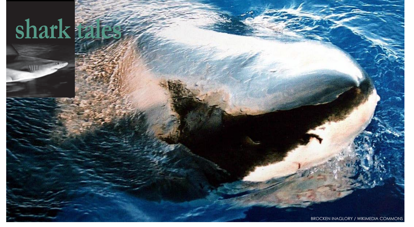
(File photo) A great white shark at Isla Guadalupe, Mexico